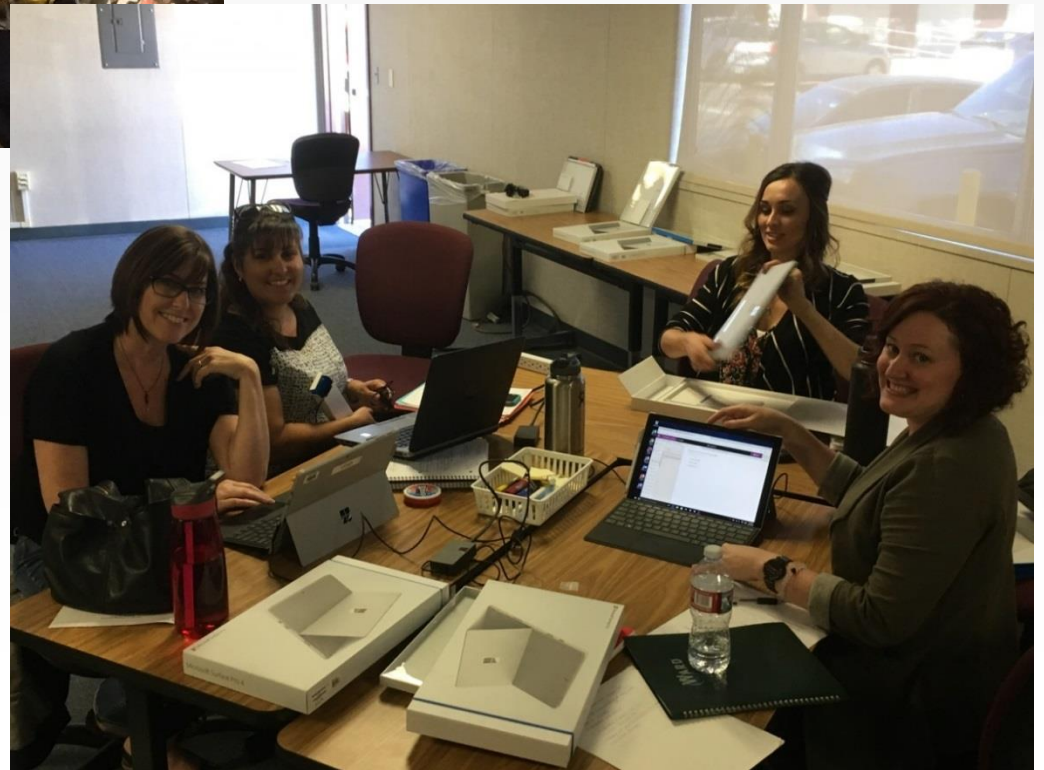
Teachers being trained to use Microsoft Surfaces for instruction.