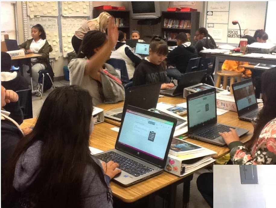
Students at Jackson learn to use the Amplify ELA program.